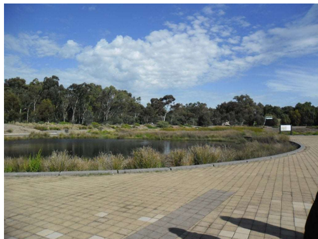
Aquifer recharge system, Lochiel Park

at the works depot carpark, tree inlets and rain gardens; to the large aquifer recharge systems at Lochiel Park and the Max Amber Sportsfield.