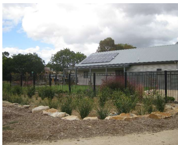
Swale, raingarden and detention basin, Lochiel Park

We are very interested to know if you have any WSUD features at your place. It could be a rainwater tank or a rain garden, a driveway built to allow water into the ground below or a green wall using captured rainwater designed to protect your house from the sun. Please let me know so we can spread the word about installing small scale projects at: