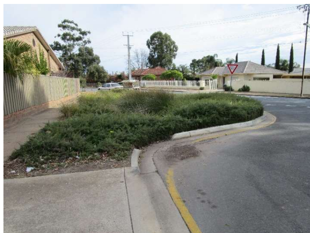
Stormwater collection garden, Reserve Rd, Campbelltown

Campbelltown already has several great examples of WSUD – from small scale; such as permeable pavers