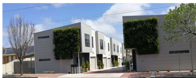
Green wall, Hectorville