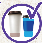
Non-Disposable Coffee Cups