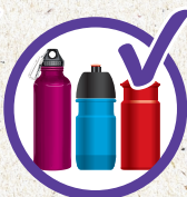
Non-Disposable Water Bottles