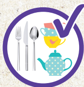
Crockery and Cutlery