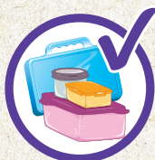
Non-Disposable Lunch Boxes and Food Packaging