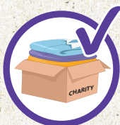
Pre-Loved Clothing, Towels and Bedding