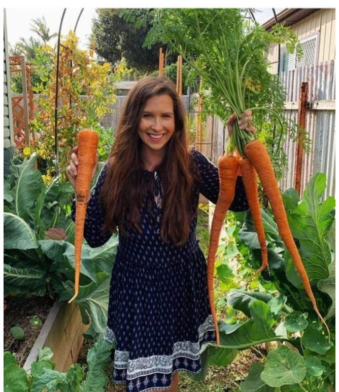
To find out more visit www.growitlocal/awards

We can't wait to see what's been growing at your place!!