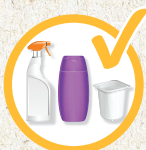
Rigid Plastic Bottles and Containers