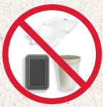
NO Polystyrene Foam