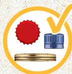
Plastic and Metal Lids