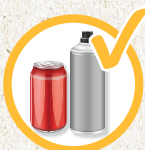
Aluminium Cans and Trays