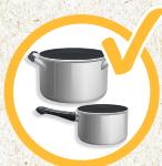
Metal Pots and Pans