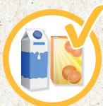
Liquid Paper Board Cartons